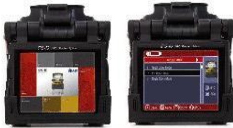
Friendly smart GUI